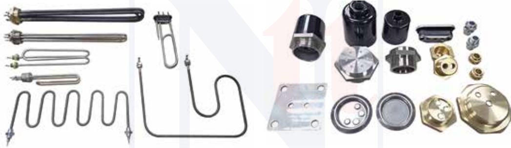
img. General Purpose Heating Element

In most of the industries, machine are key elements in manufacturing system and their breakdown can cause delays in the production system. Our NTT 11 Series straight length tubular element is the solution that meets your urgent request.